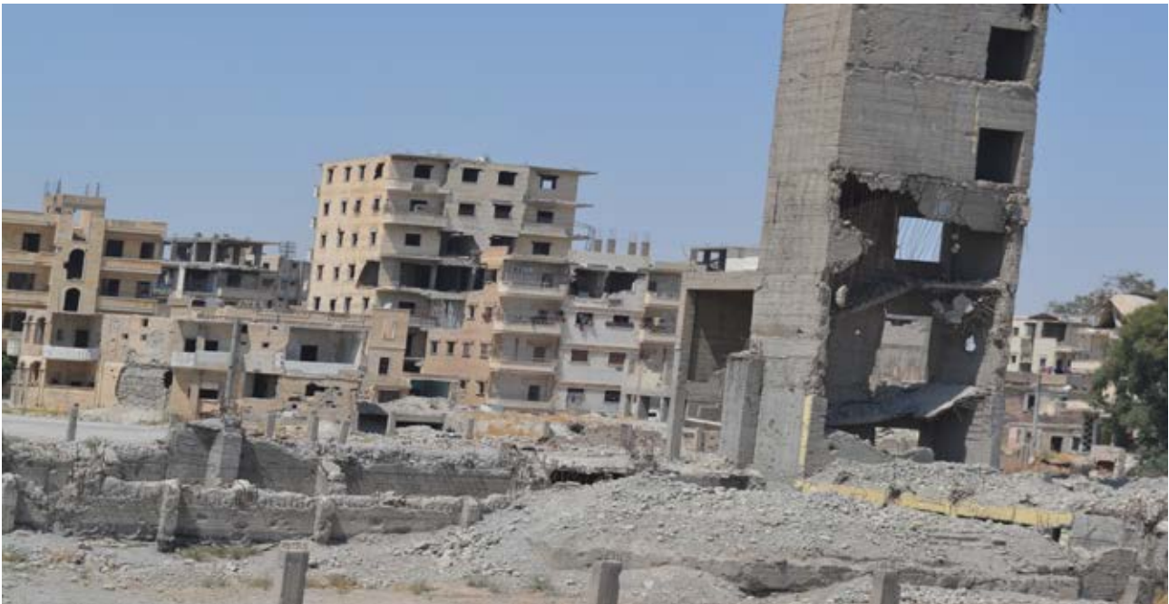
© Bahía.Z / HI - Syria, 2019