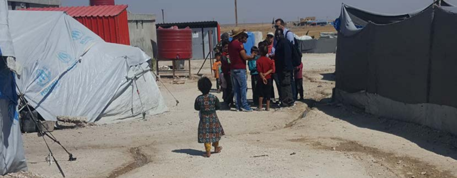
© A. Taslidžan Al-Osta/ HI - Syria, 2019