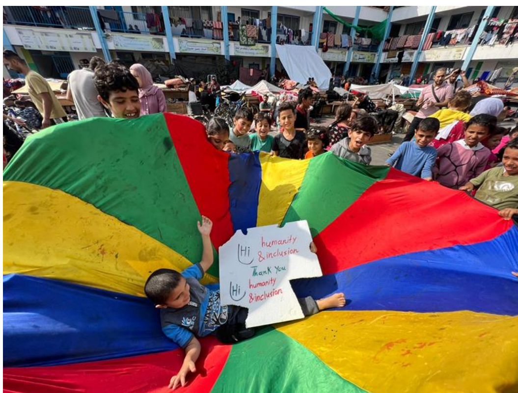
Hi team and volunteers conducted recreational activity sessions, in Khan Younis UNRWA DES shelters, Gaza, October 2023.

Humanitarian actors should systematically consider these four must-do actions to promote inclusion in their work at global, national, and subnational levels.