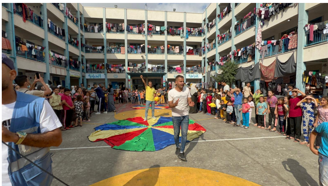
HI team and volunteers conducted recreational activity sessions, in Khan Younis UNRWA DES shelters, Gaza, October 2023.