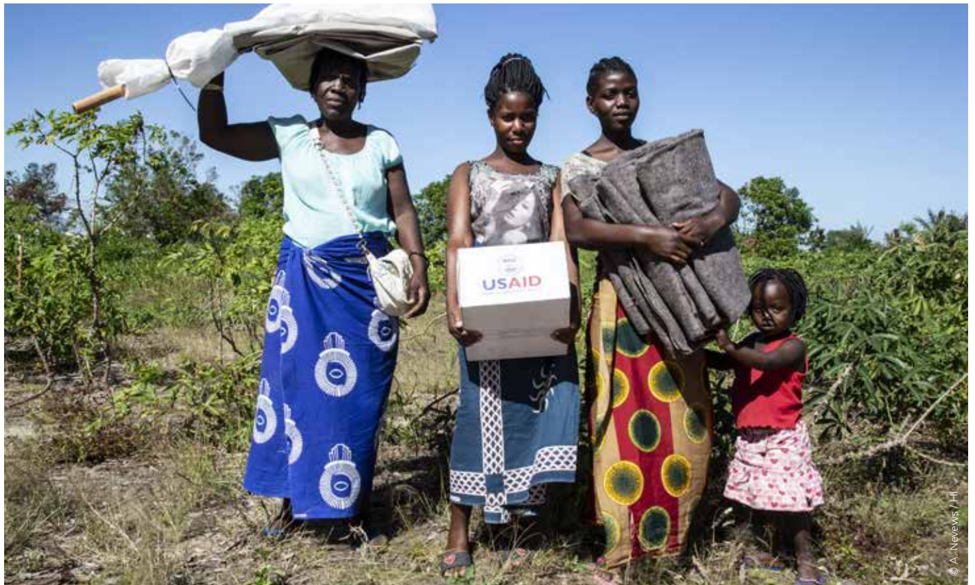
A family in Beira, Mozambique holds the supplies they received from Humanity & Inclusion's emergency distribution.

Over the long term, Humanity & Inclusion's Mozambique team will provide a sustained humanitarian response for those identified as highly vulnerable in order to improve their resilience and mitigate the short- and long-term impacts of future disasters.