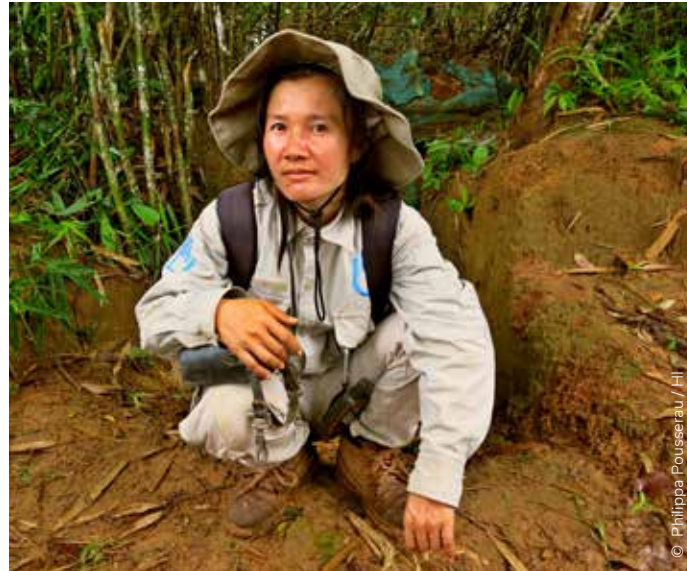
Lumngen crouches down in a dense field in Laos.

the U.S. dropped a planeload of bombs on Laos, 24-hours a day, from 1964 to 1973.