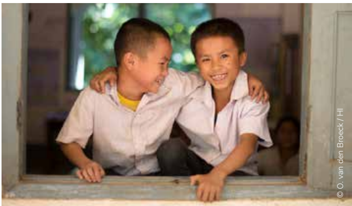
Two young school boys in Laos enjoy each others company.