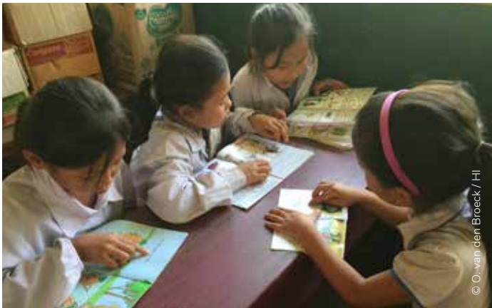
Children in Laos practice reading together.

Learning to read is one of the most fundamental stages in a child's development. Reading brings joy, it sparks the imagination, and opens the door to success. That's why earlier this year, Humanity & Inclusion—in partnership with Save the Children and Room to Read Laos—launched a project called Learn to Read. This new, five-year project will improve reading outcomes for all children—including non-Lao speakers and children with disabilities.