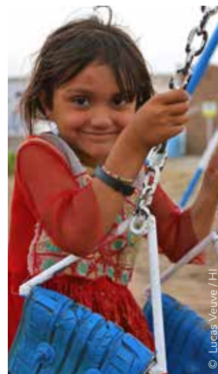
A little girl smiles while swinging on the new inclusive playground.

for supporting this fun, inclusive project.