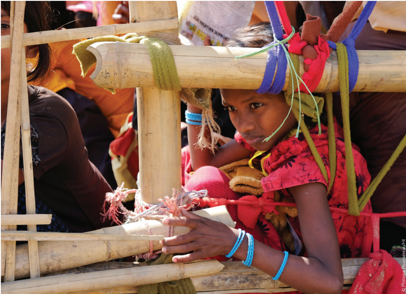
A young Rohingya girl waits in line for an aid distribution in Kutupalong refugee camp in Bangladesh.

DELIVERING AID AGAINST THE BACKDROP OF A PANDEMIC