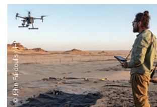
Testing a drone for demining operations in Chad, alongside partner Mobility Robotics.