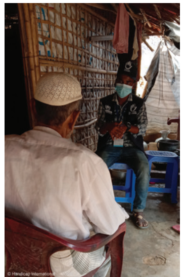
A Covid-19 awareness session