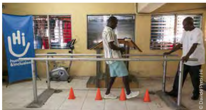
A Humanity & Inclusion beneficiary receives rehabilitation support from one of our many physical therapists in Haiti.

Before 2010, Haiti's rehabilitation network was acutely underdeveloped, with a mere 13 physical therapists in a country of 10 million people. Most of these professionals were working abroad. The earthquake—and the thousands of people who required physical therapy, braces, and artificial limbs as a result—exposed the country's need for access to quality rehabilitation specialists.