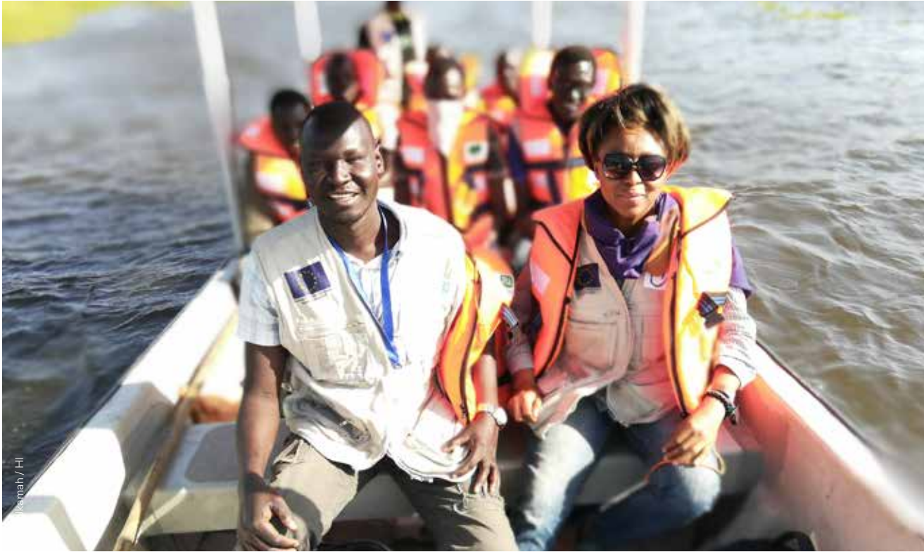
Humanity & Inclusion's Flying Team in South Sudan travels by boat to New Fangak to provide rehabilitation care to isolated communities.