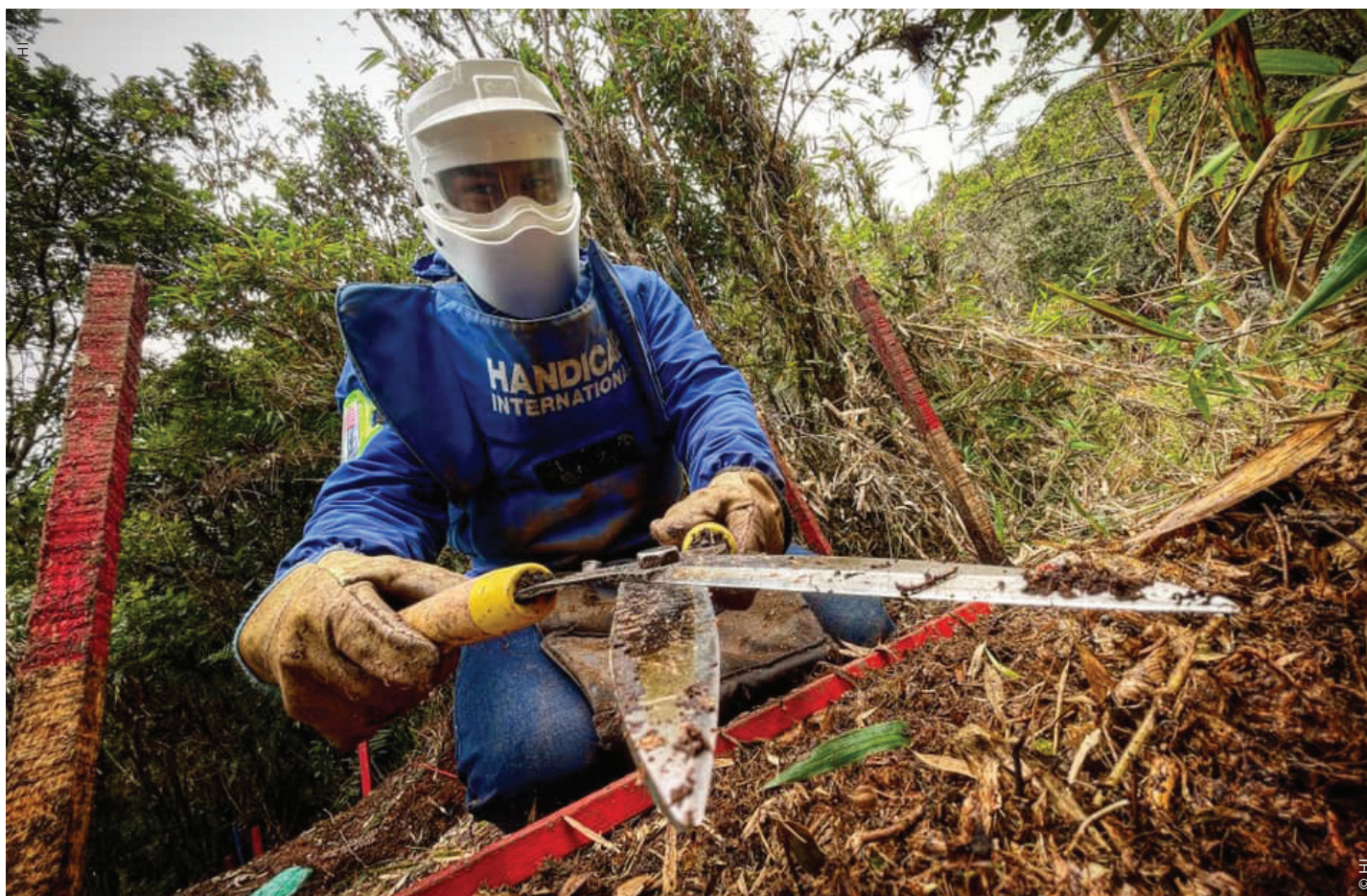
A deminer works in Colombia, where teams are looking to free 11 municipalities of landmines with funding from the U.S. Department of State.

After three years of holistic mine action in Puracé, Colombia, the town has finally been deemed free of landmines.