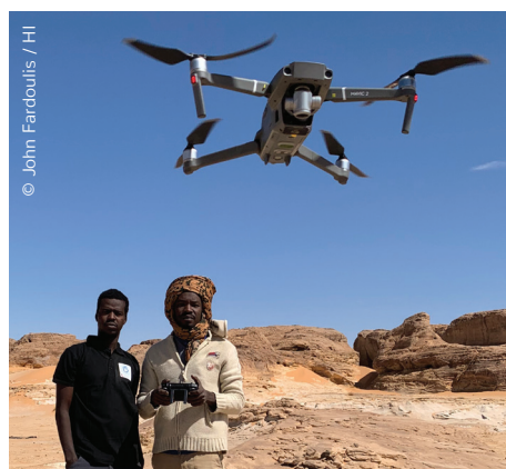
A demining team flies a drone in Chad.

"The destruction caused by conflicts and contamination by explosive remnants of war often prevents the healing of the social divide and the resumption of local economic activity," explains Perrine Benoist, Humanity & Inclusion's director of armed violence reduction. "Contaminated fields cannot be farmed, markets cannot be held, and