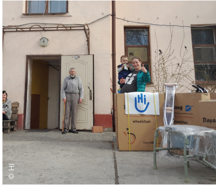
Humanity & Inclusion provides mobility aids to a center for displaced people in Dnipro, Ukraine.

Within days, the Ronen Chamber Ensemble identified, researched, and vetted a dozen values-driven organizations